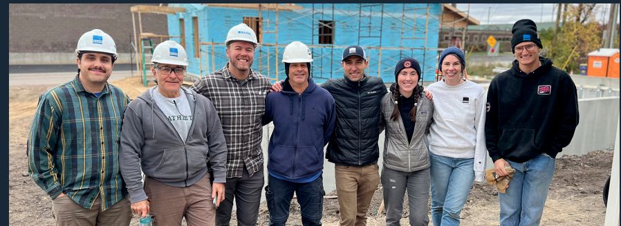
2024 Habitat for Humanity work days