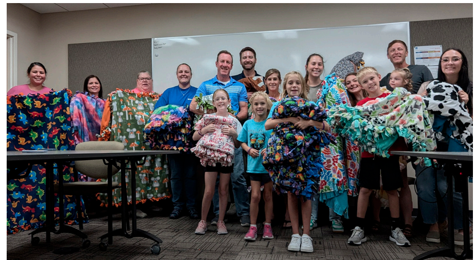
Staff and families from Barr's office in Jefferson City, Missouri, made 20+ blankets and donated them a local hospital.