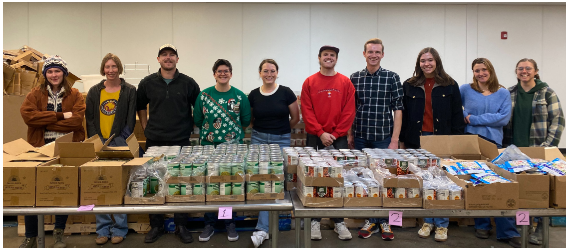
Salt Lake City staff volunteered to package food for the Mobile School Pantry Service.