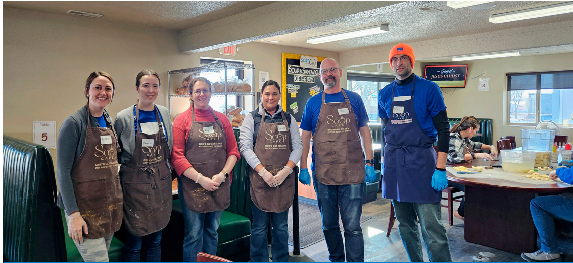
Bismark staff prepared and served lunch at Heaven's Helpers Soup Café to community members in need.