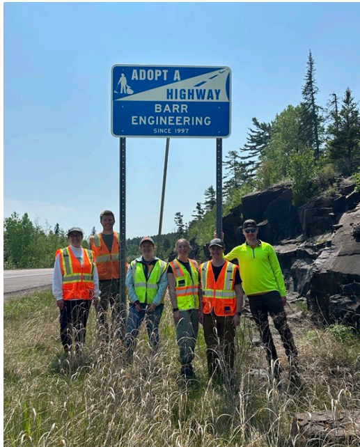
Since 1997, staff in our Duluth office have cared for a 2.6-mile stretch of Minnesota Highway 61, along the north shore of Lake Superior.

Last year marked 15 years since we adopted our giving policy, which sets aside two percent of our net corporate profit for educational and charitable donations. This contribution, including both monetary donations and pro bono services, is divided approximately evenly between two target areas: charitable organizations serving our communities and higher-education institutions in the regions most important to our company’s future.