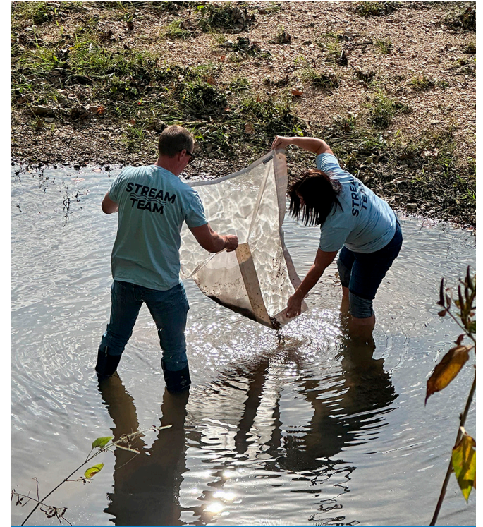
More than half of our Jefferson City staff are members of the Missouri Stream Team. In 2025, they removed trash from local streams and tested water quality on behalf of the Missouri Department of Natural Resources.