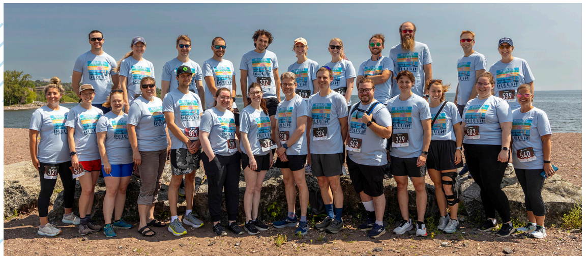
For the 12th consecutive year, we teamed up for the annual Sidewalk Shuffle in Duluth, which raises funds for local YMCA programming, memberships, and resources.