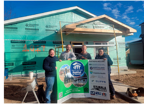
Build days (clockwise): Duluth and Hibbing staff, Minneapolis staff, Denver staff

For over 25 years, Barr has supported Habitat for Humanity, a global nonprofit organization that helps families build and improve affordable homes. Every year, staff bring their hard hats to Habitat for Humanity work sites for Barr-sponsored “build days,” where they frame walls, install siding, seal windows, and lay shingles. In 2025, our Jefferson City office also held a cleaning supply drive, collecting enough to supply four home builds. Our support continues to help families across our geographies realize their dreams of home ownership and financial stability. It’s a tradition we’re proud to continue.