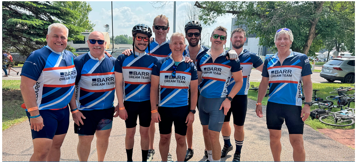
The Barr Dream Team completed the 150-mile Minnesota MS150 bike race and raised $25,000 to support those affected by multiple sclerosis.

Meanwhile, employee-owners across the company dedicated their time and talents through company-sponsored events and individual efforts to advance local causes. We planned events, rallied teams, gathered donations, and volunteered, collectively carrying out Barr's commitment to responsible corporate citizenship.