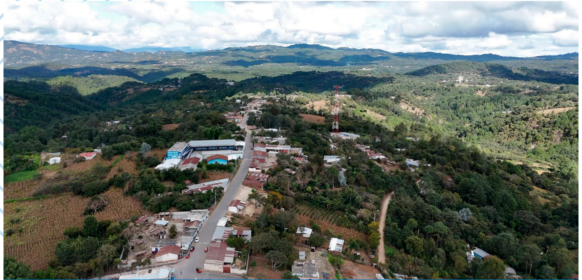
A view of the project location.